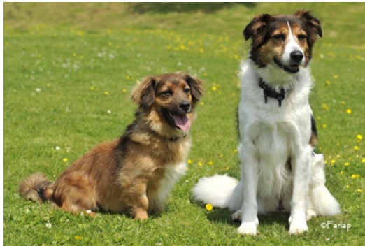
Pictured above: Bruno and Lady. They came into Gables Farm when their owner sadly passed away. We were able to place them in a loving new home

Becoming a Supporter of Gables Farm you will be helping to secure the future of stray, abandoned and unwanted dogs and cats. It is only thanks to people like you that we are able to give these animals the second chance that they need.